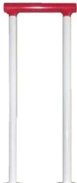
Hoop or Wicket

The object is to be the first side to score seven points. A point is scored when a ball passes through the hoop being contested in the correct direction.